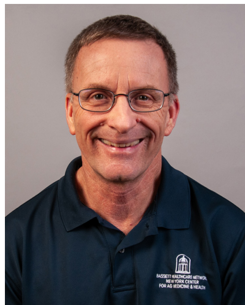
BY JIM CARRABBA SENIOR AGRICULTURAL SAFETY SPECIALIST, NORTHEAST CENTER FOR OCCUPATIONAL HEALTH AND SAFETY

WIN A GRAIN RESCUE TUBE AND TRAINING FOR YOUR FIRE DEPARTMENT!