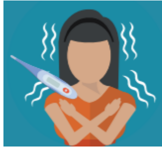
Fever or chills