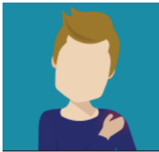
Pain and swelling of the arm